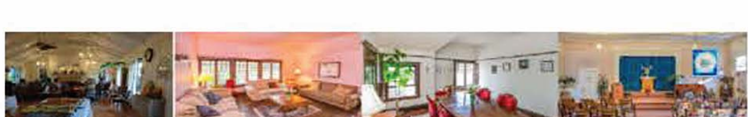
Cottage Interior - Group Meeting Room - Conference Room - Historic Sanctuary